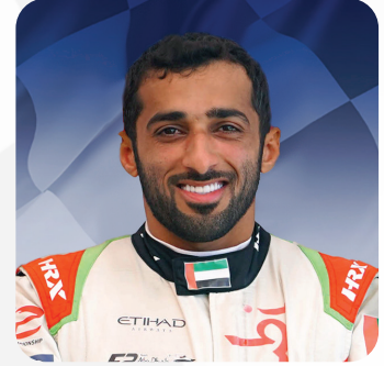
Rashed Al Qemzi